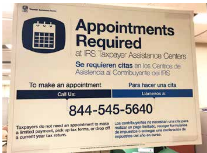
FIGURE 2.10.1, Sign at Taxpayer Assistance Center in Arkansas, Showing Appointment Requirement

Finally, the National Taxpayer Advocate is confused by the IRS assertion that it has updated the TAC signs to indicate appointments are not needed for certain routine tasks. When TAS staff photographed the "Appointments Required" signs at four TACs last year, the signs already contained the language about no appointments necessary to make a limited payment, drop off a current year tax return, or pick up a tax form. New photographs taken at the end of May 2018 of the same locations, such as the one from Arkansas below, show the same signs in place: